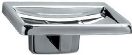
AI0118C Bright finish