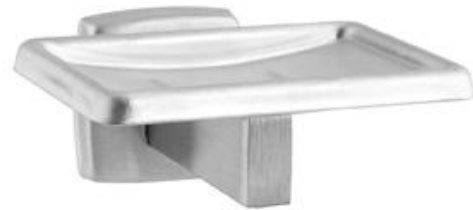
AI0118CS Satin finish