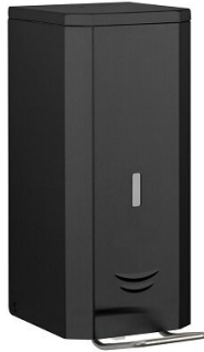
IFSDJP0034B Black finish