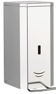
IFSDJP0034C Bright finish