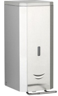
IFSDJP0034CS Satin finish