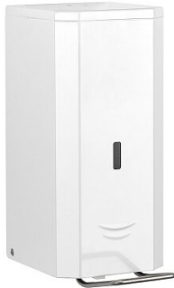
IFSDJP0034 White finish