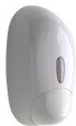
REF: IFS04W Colour: WHITE