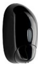
REF: IFS04BK Colour: BLACK