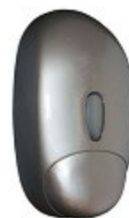
REF: IFS04G Colour: SILVER