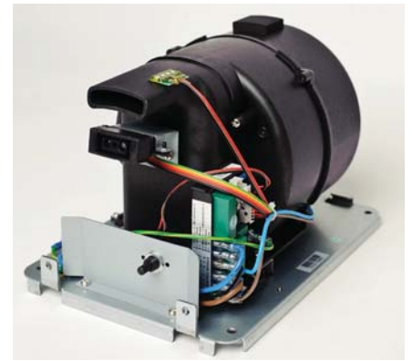
Under the Cover