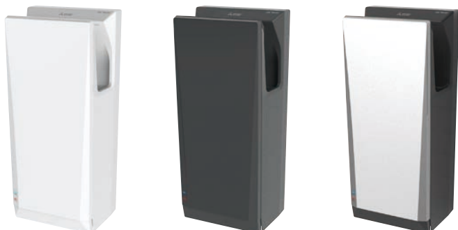
(JT-SB216KSN2 model available only in white)